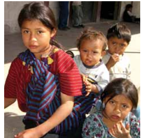
A young girl takes care of her 3 siblings

Having lived and worked in Guatemala for 16 years, I am no longer surprised to meet a mother pregnant with her eighth, tenth, or even twelfth child, despite struggling to put even a small amount of food on the table, but I still find these situations heartbreaking.