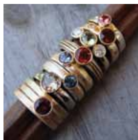
Various ring designs by McFarland Designs

Firma de Abogados www.firmadeabogados.com.gt for their generous donation of free legal services to WINGS in Guatemala.