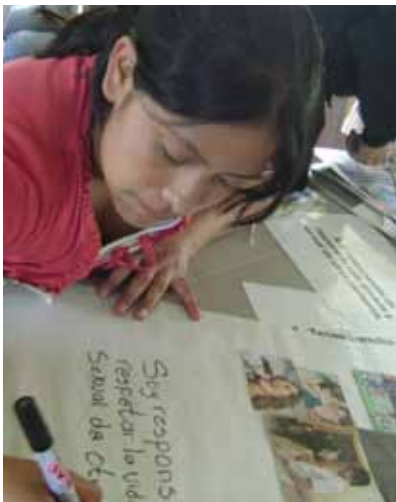
A Youth WINGS peer educator works on a reproductive health collage