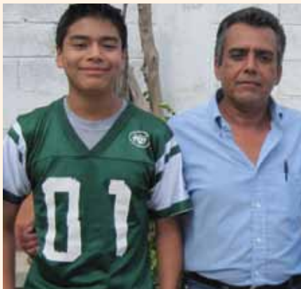
Father and son support family planning

He graduated as WINGS' first ever Men's peer educator in December 2008. Along with counseling men on drug and alcohol abuse, he also talks to them about preventing STIs and distributes condoms. He came to the second peer educator training this July to talk to the men about what it means to be a responsible father. As an example,