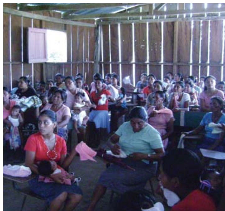
Women attending a family planning talk in the Petén