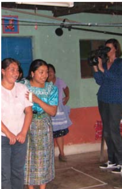
Filming of WINGS' family planning talk