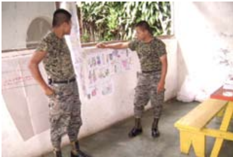
Members of the military participate in a WINGS for Men workshop.

WINGS and USAID rolled out a mass media campaign, which includes radio spots, posters, and leaflets distributed throughout the program area.